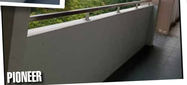
PIONEER Installation of Parapet Railings at Blk 643 Jurong West St 61