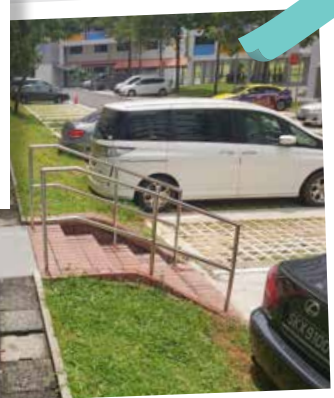
NANYANG Installation of Handrail at the staircase toward car park at Blk 976 Jurong West Street 93