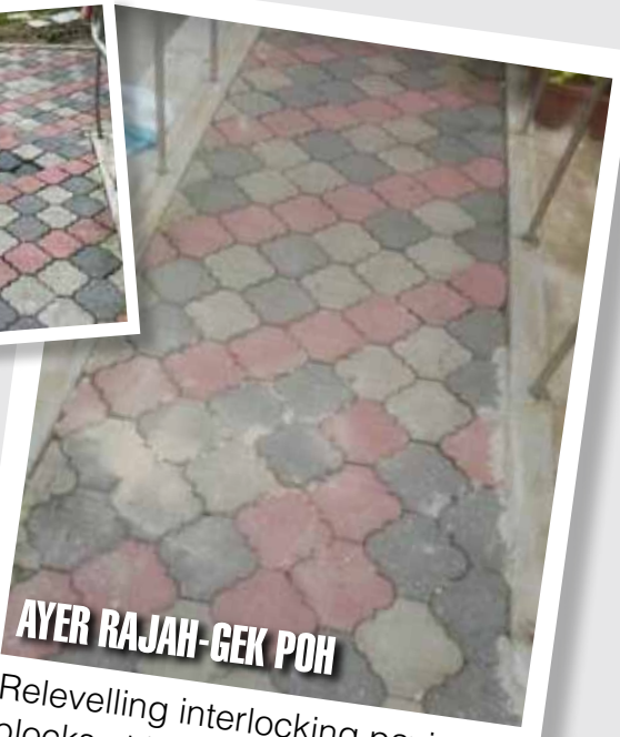
AYER RAJAH-GEK POH Relevelling interlocking paving blocks at Blk 35 Teban Garden