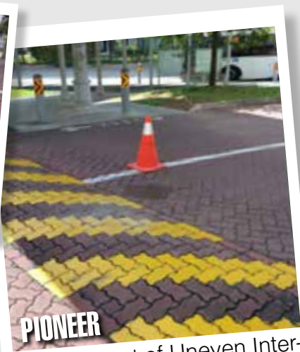
PIONEER Replacement of Uneven Inter-Locking Tiles At Service Road Near High Linkway at Blk 658D Jurong West St 65