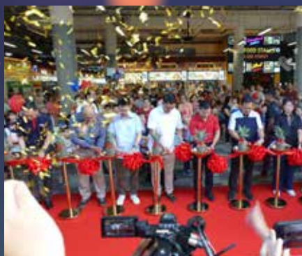
Reopening of Jurong West Hawker Centre - PG 7