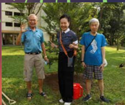
West Coast GRC and Pioneer SMC Unite for a Lush Tomorrow - PG 4