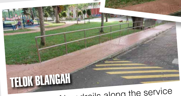
TELOK BLANGAH Installation of handrails along the service road towards Blk 14 Dover Close East.