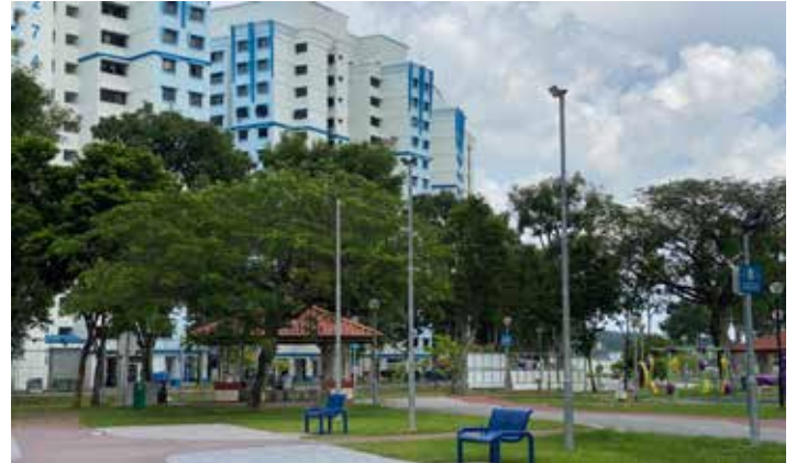
Blk 274 Gek Poh