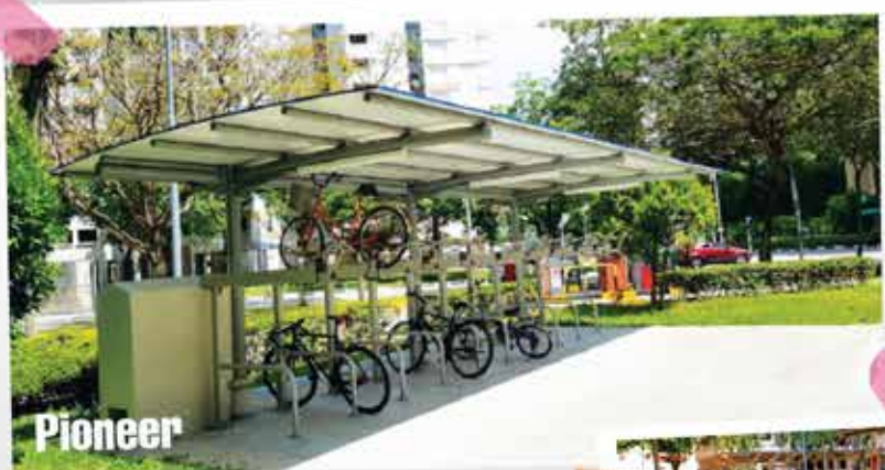
Construction of Bicycle Shed with Double Tiered Bicycle Racks in front of MSCP 659 Jurong West Street 65