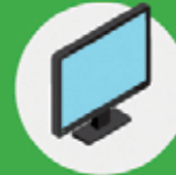
TV & Desktop Monitor