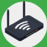
Network & Set-Top Box