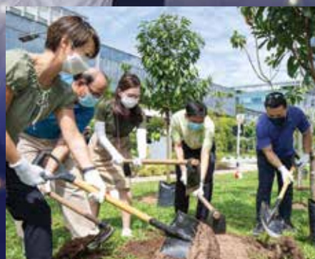
Pasir Panjang Park Gets A Makeover! - PG 4