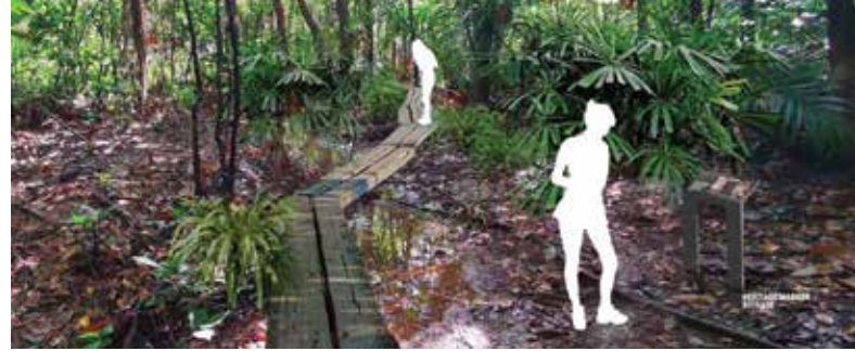
An artist's impression of a nature trail in the upcoming nature park in Dover Forest, also described by NParks as the Ulu Pandan west greenfield site.