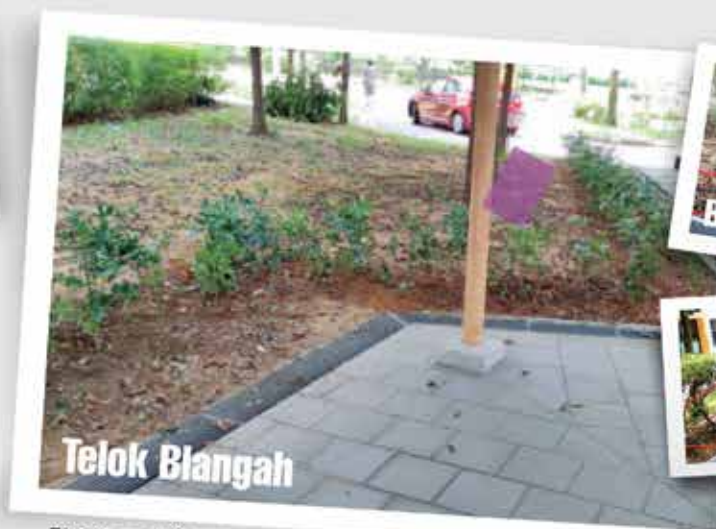
Planting of Shrubs at the Open Area around Blocks 28B and 28C Dover Crescent