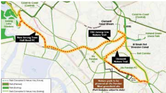
A map showing the upcoming recreational trails. Map: National Parks Board.

West Coast has launched an exciting development that will transform its landscape with new nature trails blended with touches of culture and history. It will also protect and conserve the environment and the natural biodiversity.