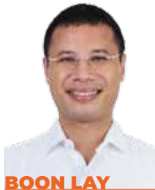
Mr Desmond Lee Minister for National Development Minister in-charge of Social Services Integration MP for West Coast GRC (Boon Lay)

Every Thursday, 7.30pm – 9.30pm (Except Public Holidays) Block 207 Boon Lay Place #01-215, S640207 Tel: 6261 6085