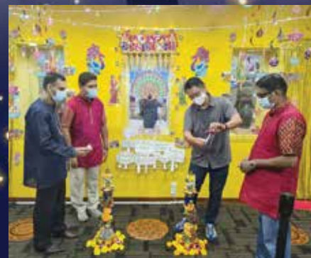
Deepavali Celebrations Across West Coast Town - PG 13