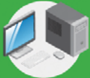
Computer & Laptop