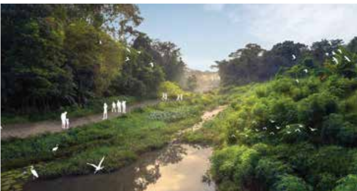
An artist's impression of the upcoming Clementi Nature Trail, using a photograph by K Yap, along Clementi Forest stream.

At the national level, the Corridor will serve as an ecological connection between Bukit Timah Nature Reserve and Southern Ridges. It will total 18km of nature trails with two main “lines”, the Clementi Nature Trail and Old Jurong Line Track.