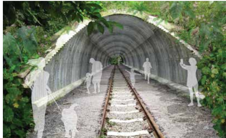
An artist's impression of the upcoming Old Jurong Line nature trail at the Clementi Road tunnel.

The 2km Clementi trail will link the Rail Corridor to the forest in Ulu Pandan. It is expected to be completed by 2023. NParks will partner the community to form Friends of Ulu Pandan to safeguard its green spaces.