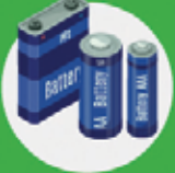
Household Battery & Powerbank