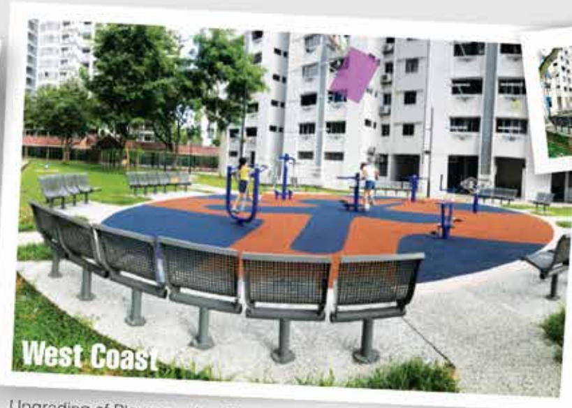
Upgrading of Playground to Elderly Fitness Corner between Blocks 509 and 510 West Coast Drive