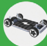
Electric Vehicle Battery