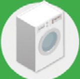
Washing Machine & Dryer