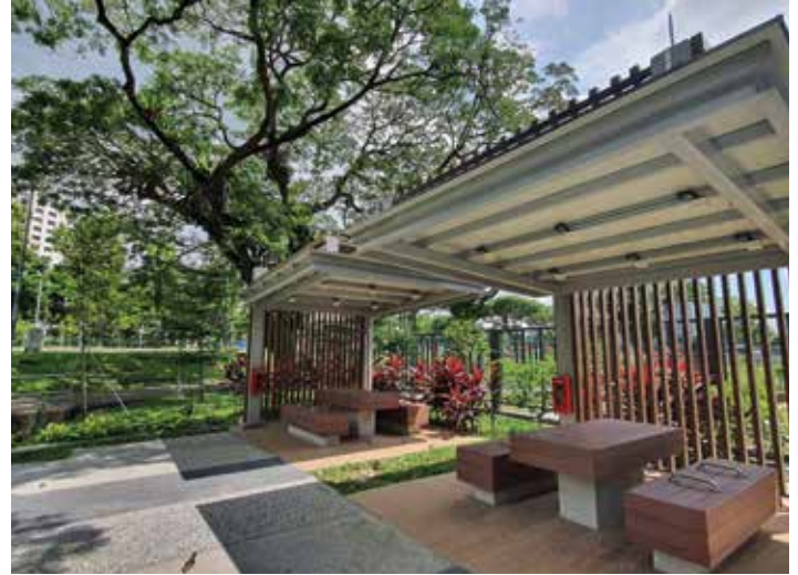
New Park Shelter near Blk 266 Boon Lay Drive