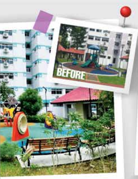
und near Block 262A Boon Lay Drive