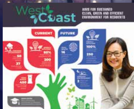
Introducing West Coast's Action for Green Towns! - PG 2