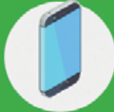
Mobile & Tablet