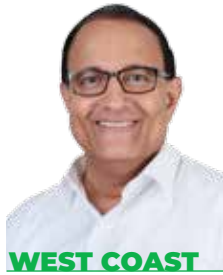
Mr S Iswaran Minister for Transport Minister in-charge of Trade Relations MP for West Coast GRC (West Coast)

Every Monday, 7.30pm – 9.30pm (Except Public Holidays) Block 729 Clementi West Street 2 #01-346, S120729 Tel: 6777 0696