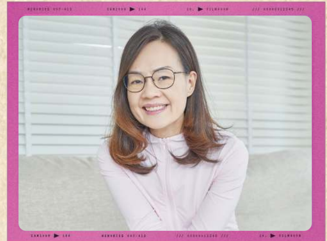
MS RACHEL ONG MP for Telok Blangah