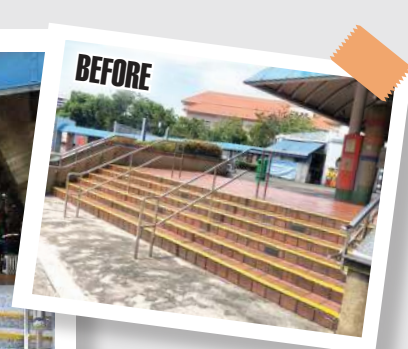
Urban Gardens Road