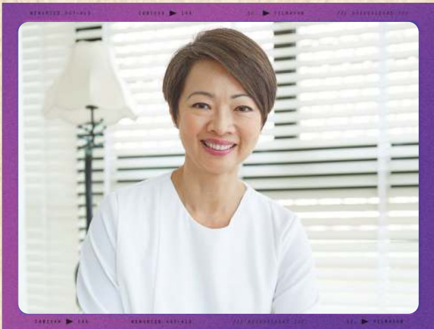
MS FOO MEE HAR MP for Ayer Rajah-Gek Poh