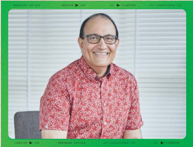
MR S ISWARAN MP for West Coast

photos of our MPs. Can you tell who's who?