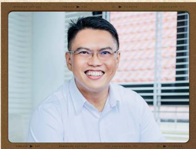
MR PATRICK TAY, BBM MP for Pioneer