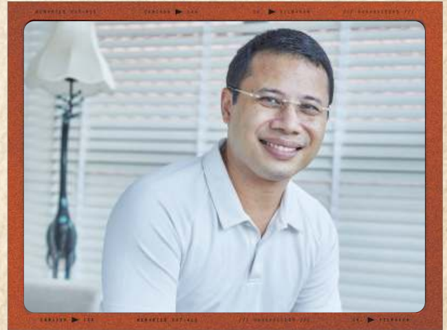
MR DESMOND LEE MP for Boon Lay