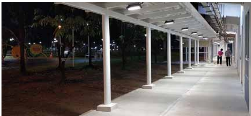
New extended covered linkway at Block 48 Teban Gardens Road.