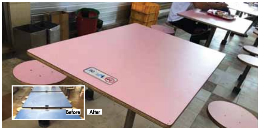
Repairs and Redecoration at Block 221A/B Boon Lay Food and Market Place