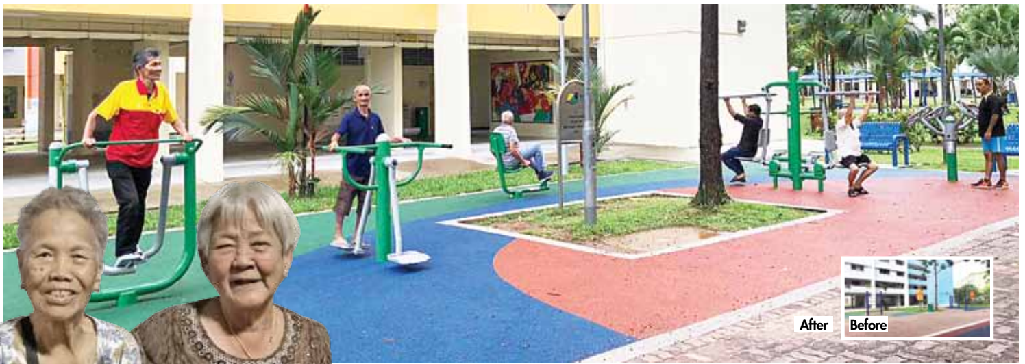
Upgraded elderly fitness corner in front of Block 730 Clementi West Street 2.

"This newly upgraded fitness equipment is very useful for senior citizens like us! Both of us come down to exercise every morning!"