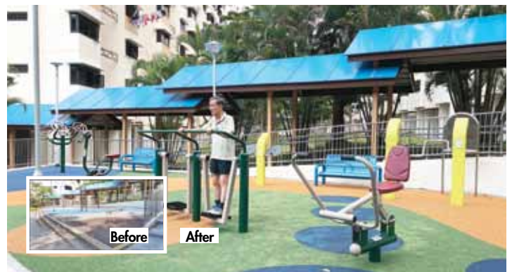
Upgraded elderly fitness corner near Block 54/55 Telok Blangah Drive.