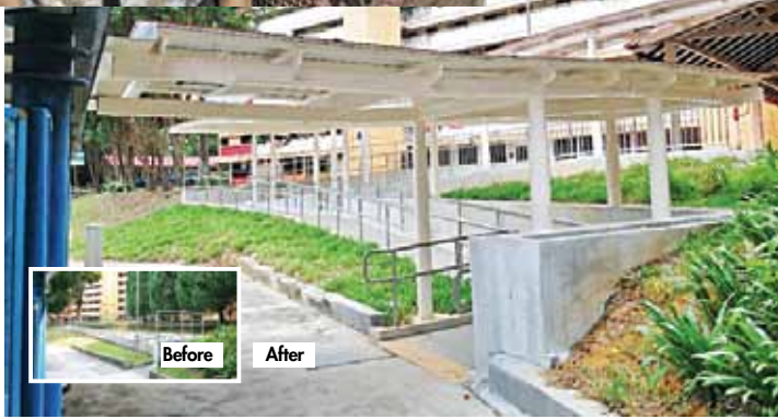
Upgraded (now BFA) ramp with shelter between Block 1 Dover Road and bus stop.