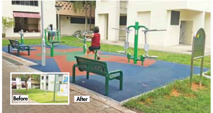
New elderly fitness corner at Block 88 Telok Blangah Heights.