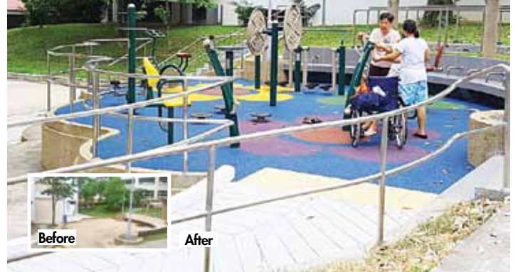
New elderly fitness corner near Block 75 Telok Blangah Drive.