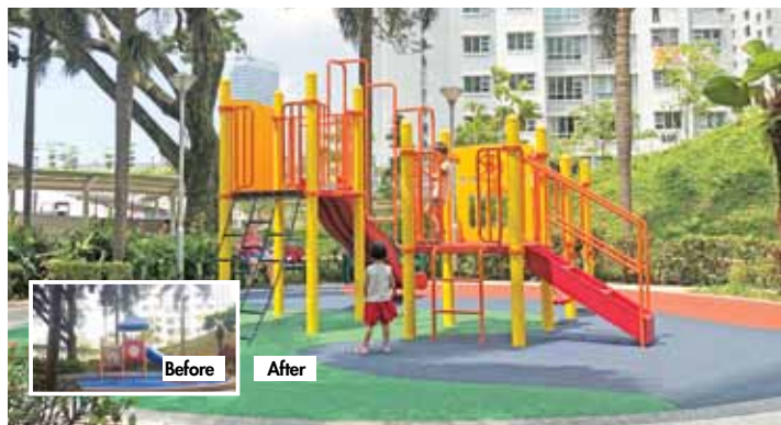
Upgraded children's playground at Block 74 Telok Blangah Heights.