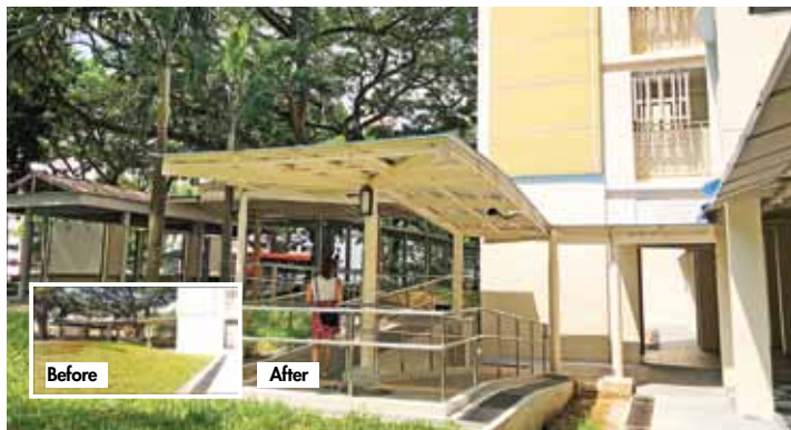
New BFA ramp at Block 50 Telok Blangah Drive near bus stop.