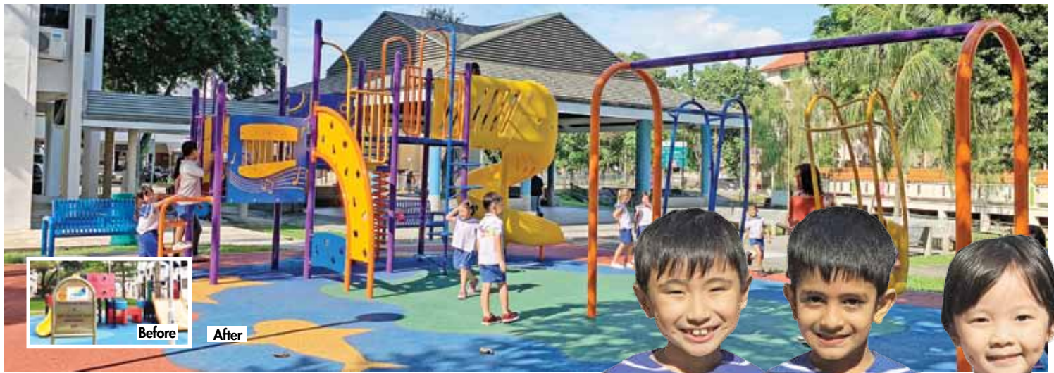
Upgraded children's playground beside Block 510 West Coast Drive.