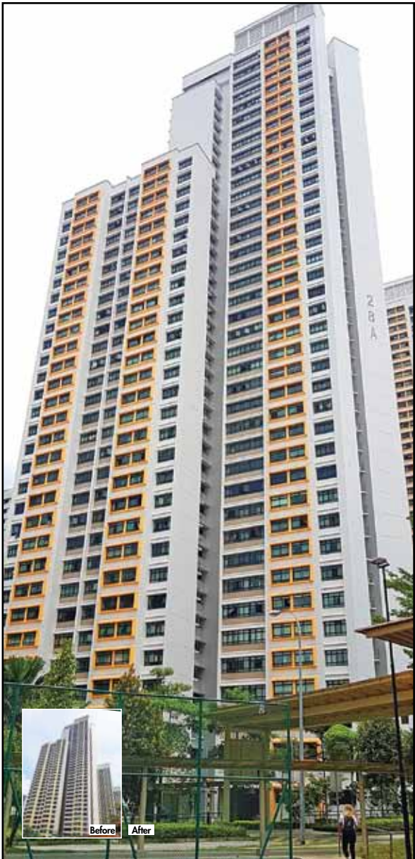
Repairs and Redecoration at Block 28A to 28D Dover Crescent.