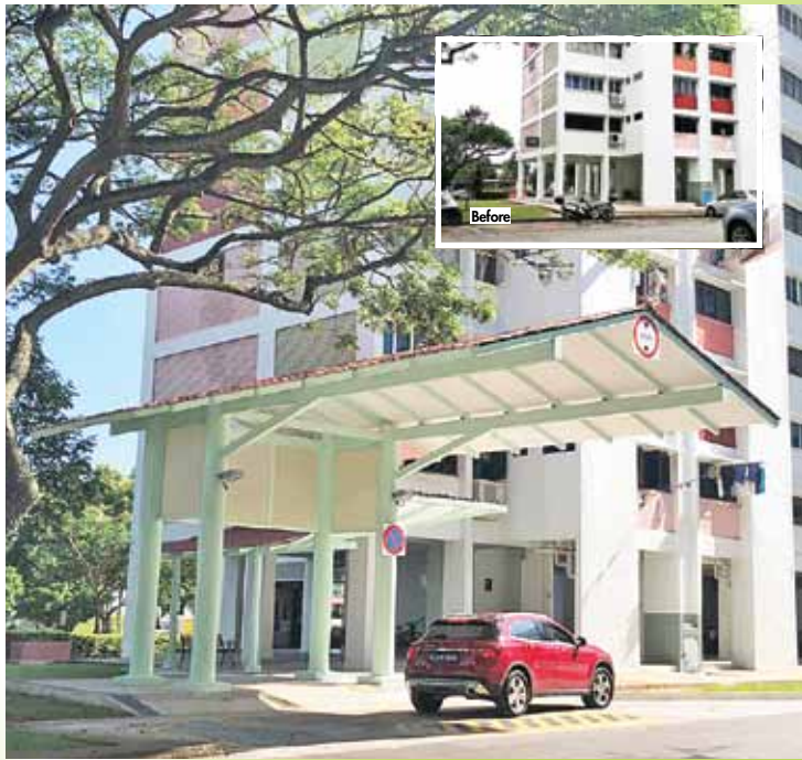
New drop-off porch in front of Block 408 Pandan Gardens