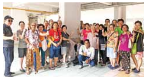
Blangah Court RC