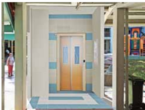
Artist's impressions of what the our lifts will look like when installed.

With a resounding “Yes”, residents in selected apartment blocks at West Coast Drive/Clementi West Street 2 have voted for direct lift access.