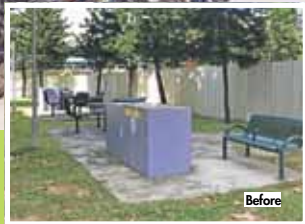
New bicycle shed in front of Block 688 Jurong West Central 1