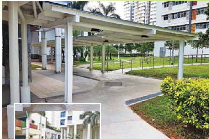
New covered linkway between Block 60 to 61 to existing linkway towards bus stop in front of Block 22 Teban Gardens Road