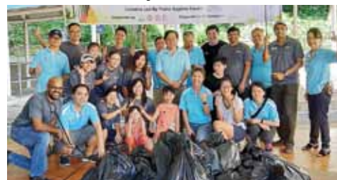
Depot Heights RC