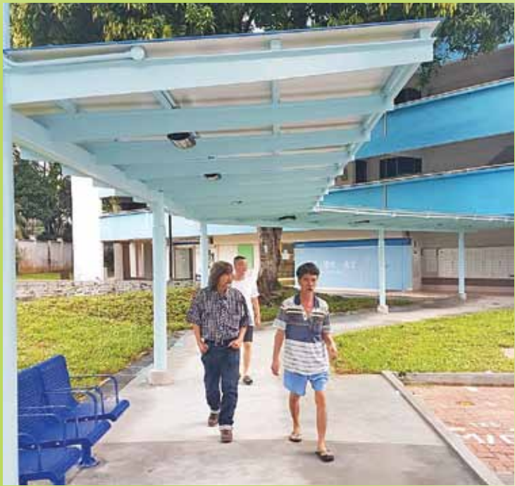
Upgraded covered linkway between Block 611 and 612 Clementi West Street 1