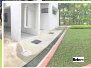
New bicycle shed between Block 609 and Blk 610 Jurong West Street 62