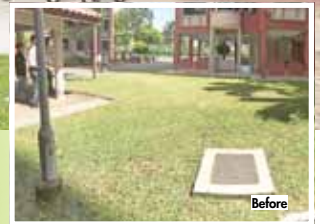
New bicycle shed between Block 695 and 696 Jurong West Central 1