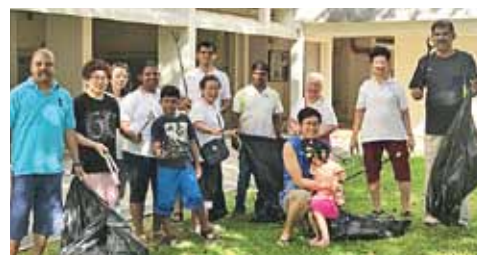
Blangah Garden RC