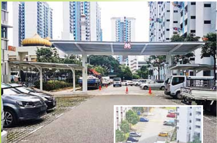
New high and low covered walkway between Block 53 to 55 Teban Gardens Road