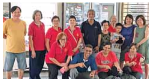
Blangah View RC