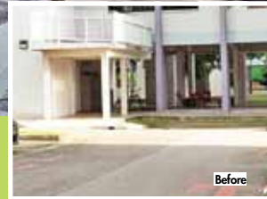
New drop-off porch in front of Block 716 Clementi West Street 2