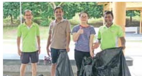
Dover Crescent RC