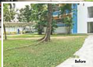
New bicycle shed at Block 648 MSCP Jurong West Street 61