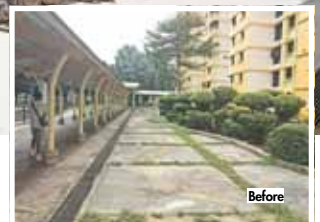
New bicycle shed in front of Block 651A Jurong West Street 61