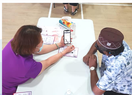
E-Payment Learning Journey (EPLJ) for our seniors