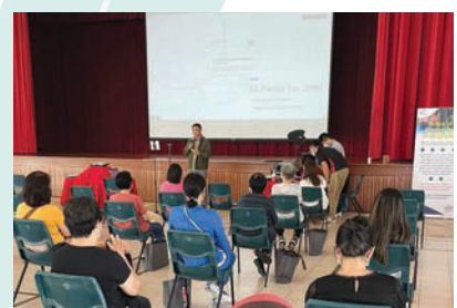
Connect@Pioneer: My Exit Strategy

Connect With Us Pioneer Community @SG Pioneer Pioneer Community