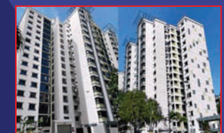
Repair & Repainting Works Location: Blk 601 – 613 Estimated Completion: 3rd Quarter 2023