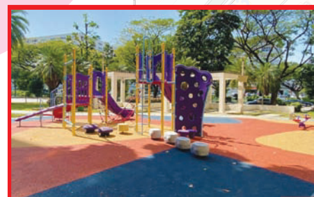
Upgraded Children's Playground near Blk 653C