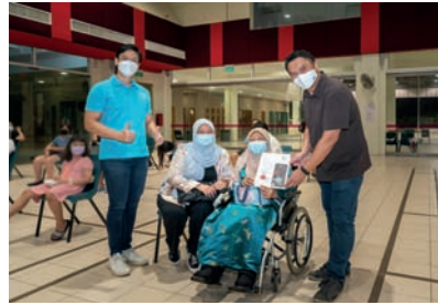
New Creation Church Gift of Love Initiative, where supermarket vouchers were given to financially challenged families.