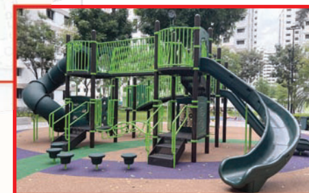
Upgraded Children's Playground near Blk 663B

"Play is their brain's favourite way of learning."