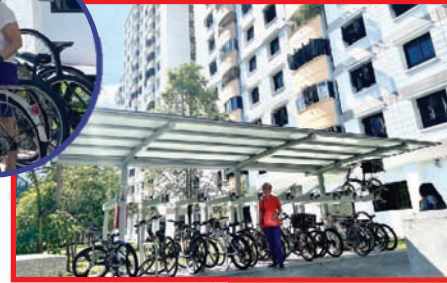
New Bicycle Shed near Blk 666A

"Riding a bicycle is about getting back to basics."