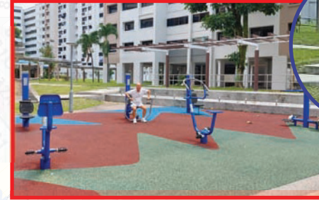
Upgraded Elderly Fitness Corner near Blk 640