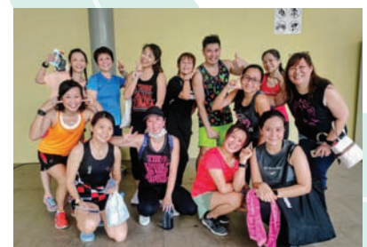
Community Sports Network @ Pioneer