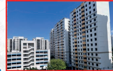
Completed R&R at Blk 666B