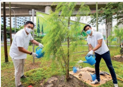
Tree Planting in our Community