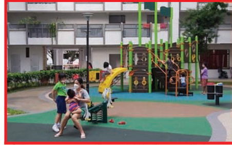
Upgraded Children's Playground near Blk 610