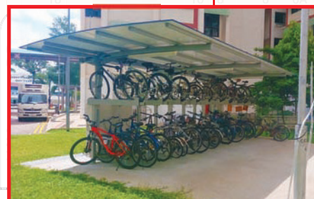
New Bicycle Shed near Blk 661B