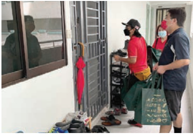
DBSSU Care Pack Distribution across Pioneer Community