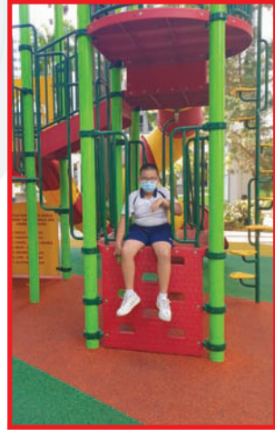
Upgraded Children's Playground near Blk 602