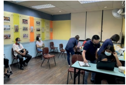
Mobile Vaccination Team