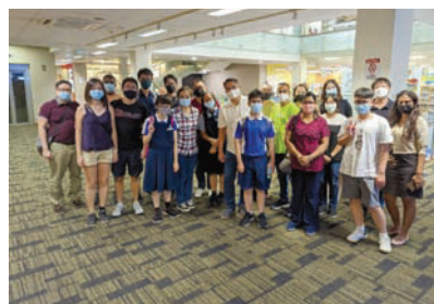
New Sustainability Taskforce to implement environment-friendly initiatives in the community