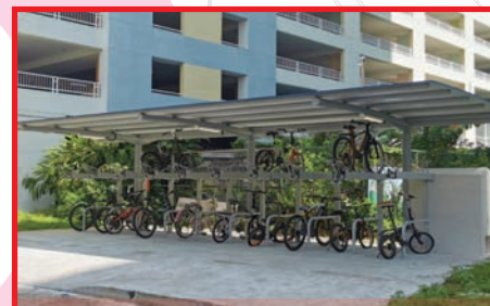
New Bicycle Shed near Blk 990 MSCP

More than 10,200 residents benefitted from Lift Enhancement Programme at Blk 601 – 609, 611 - 612, 648A-D, 649B, 650A-C 657B, 658A -D, 659A-D, 660A-B, 661A-B, 662A-B