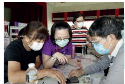
SED@P - A Seniors' Digitalisation Experience