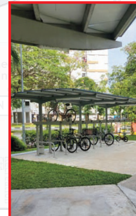
New Bicycle Shed near Blk 659 MSCP