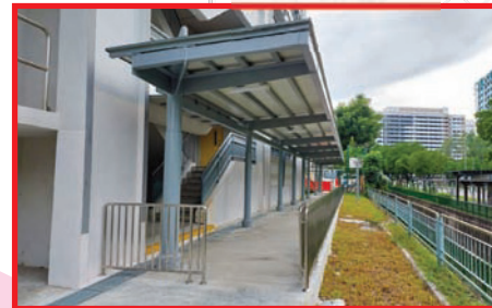
New Low Covered Linkway from Jurong West Primary School gate to Blk 601A MSCP

More than 10,200 residents benefitted from Lift Enhancement Programme at Blk 601 – 609, 611 - 612, 648A-D, 649B, 650A-C 657B, 658A -D, 659A-D, 660A-B, 661A-B, 662A-B