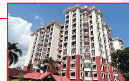
Completed R&R at Blk 695