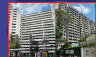
Repair & Repainting Works Location: Blk 659A – 659D, 660A – 660D, 661A – 661D & 662A – 662D Estimated Completion: 3rd Quarter 2023