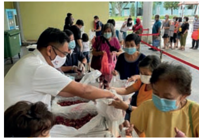
Food Rescue Programme where rescued food is distributed to the community