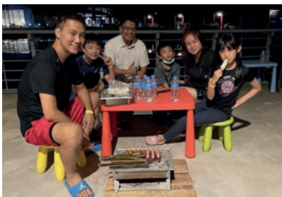
Overnight Camping Event at Singapore Discovery Centre with Pioneer Families