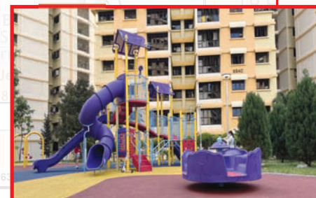
Upgraded Children's Playground at Blk 652C