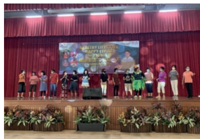
Happy Lifestyle Event for our Seniors