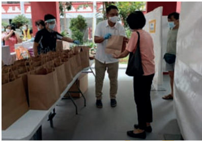
ART Self-Test Kit Distribution