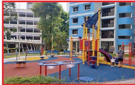
Upgraded Children's Playground near Blk 650A

More than 8,300 residents benefitted from Repairs and Repainting Programme at Blk 687 – 696, 663A-D, 664A-D, 665A-B, 666A-B