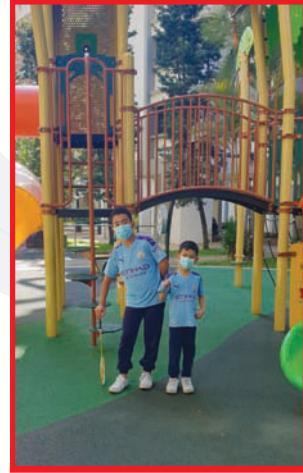
Upgraded Children's Playground near Blk 605