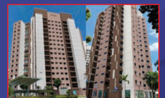
Repair & Repainting Works Location: Blk 648A – 648D, 649A, 649B, 650A – 650D Estimated Completion: 3rd Quarter 2023