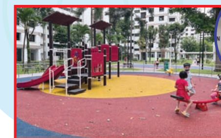
Upgraded Children's Playground near Blk 664B