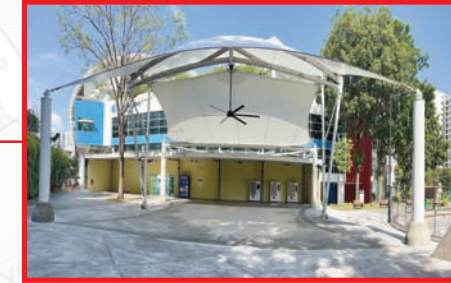
New Overhead Fan in-front of Blk 688

More than 8,300 residents benefitted from Repairs and Repainting Programme at Blk 687 – 696, 663A-D, 664A-D, 665A-B, 666A-B