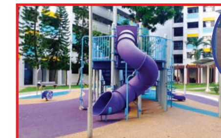
Upgraded Children's Playground Near Blk 659D