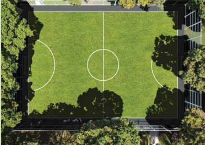
Upgrading of existing street soccer court to futsal court at Teban Neighbourhood Park, behind Block 41 Teban Gardens Road