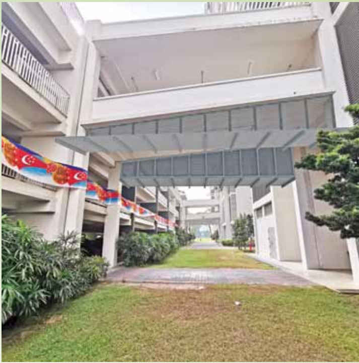
New extended roof on existing high covered linkway between Block 21 and 22A multi-storey car park at Teban Gardens Road