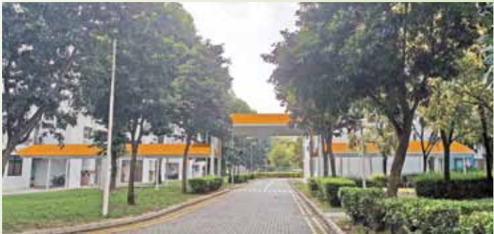
New covered linkway between Block 32 and 64 Teban Gardens Road, viewed from the road (above) and from above (below).