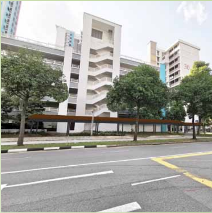
New covered linkway between Block 30 and 63A Multi-Storey Car Park Teban Gardens Road