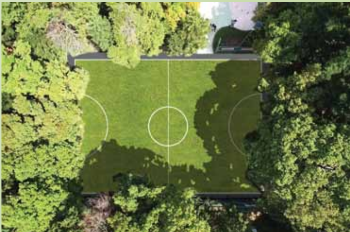
Upgrading of existing street soccer court to futsal court at Block 410 Pandan Gardens