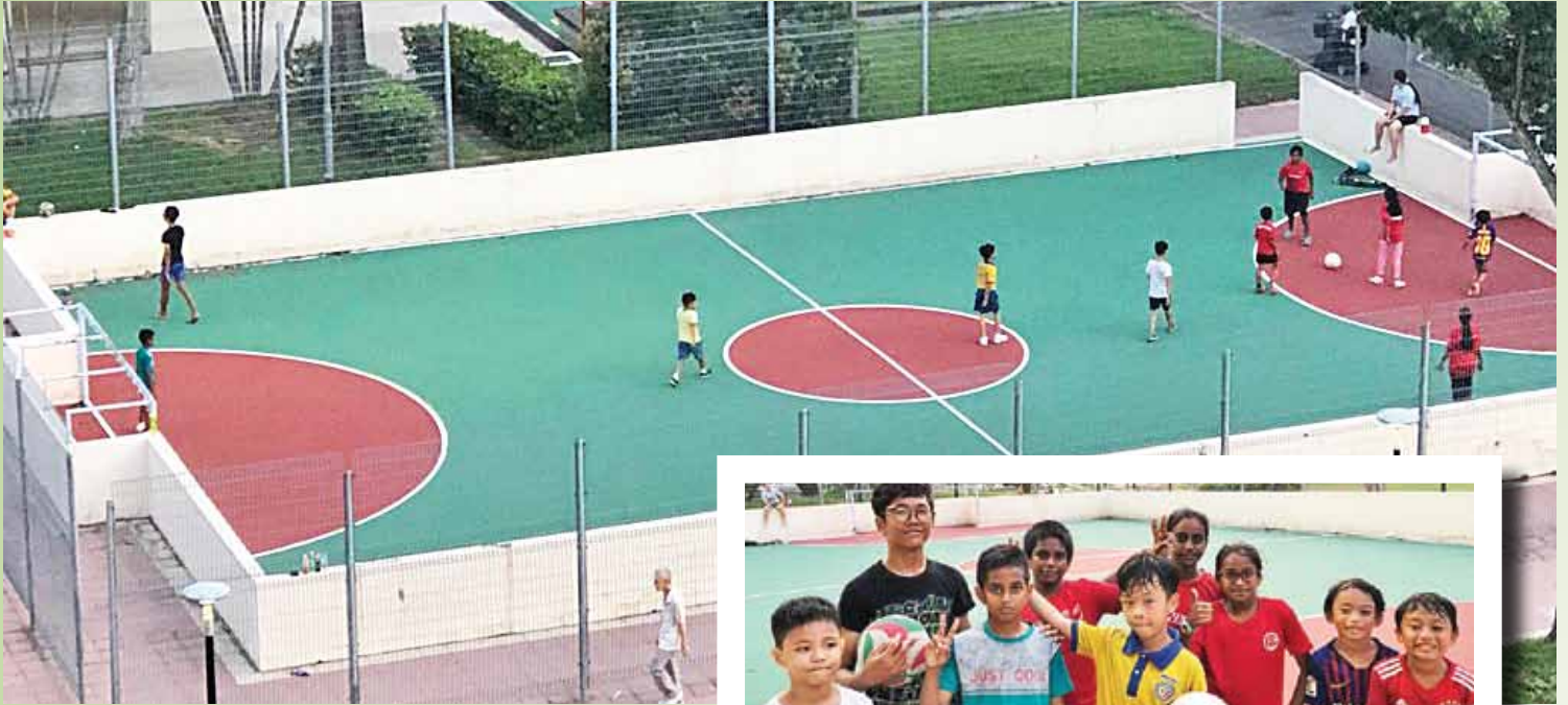
Upgraded street soccer court beside Block 704 West Coast Road

Congratulations to Town Council for upgrading this court!