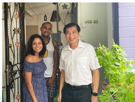
Meeting Residents at House Visits