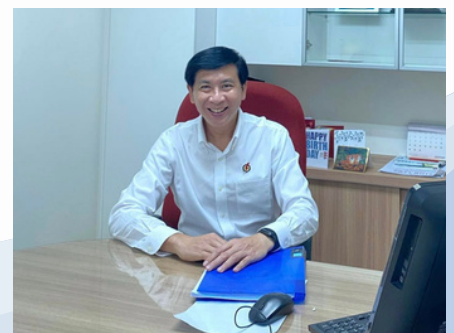
Resumption of Physical MPS