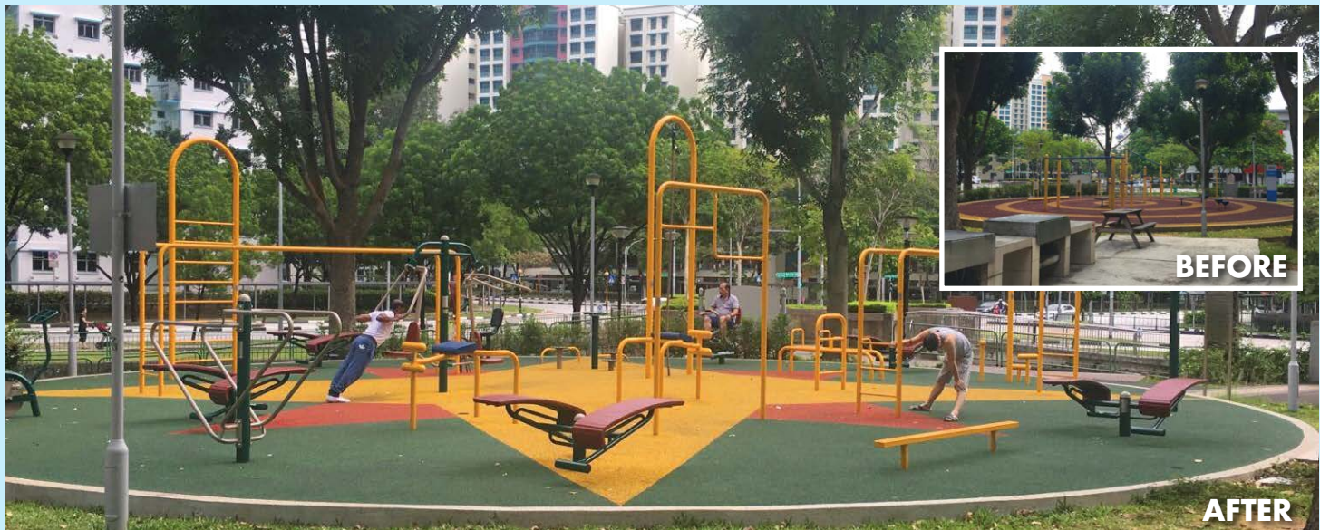
Upgrading of existing adult fitness corner near Block 665A Jurong West Street 65