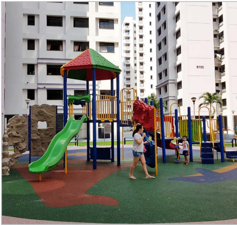
Upgrading of existing children's playground at Block 674A Jurong West Street 65