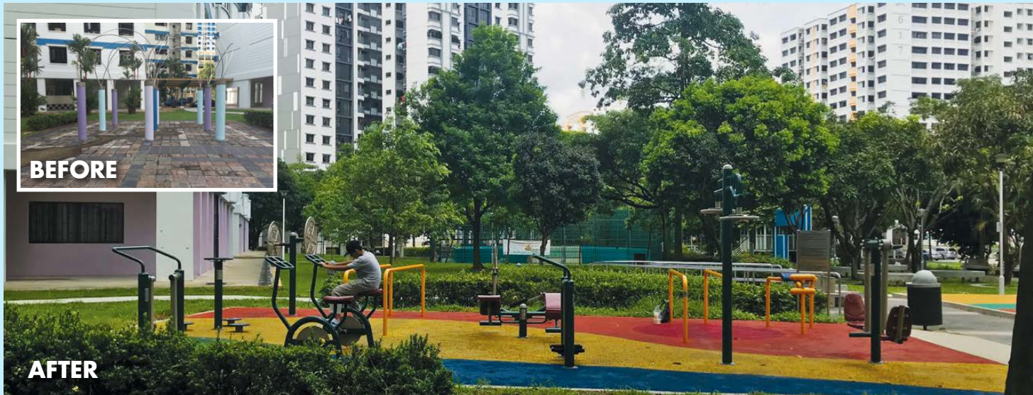
Proposed fitness corner near Block 666A Jurong West Street 65