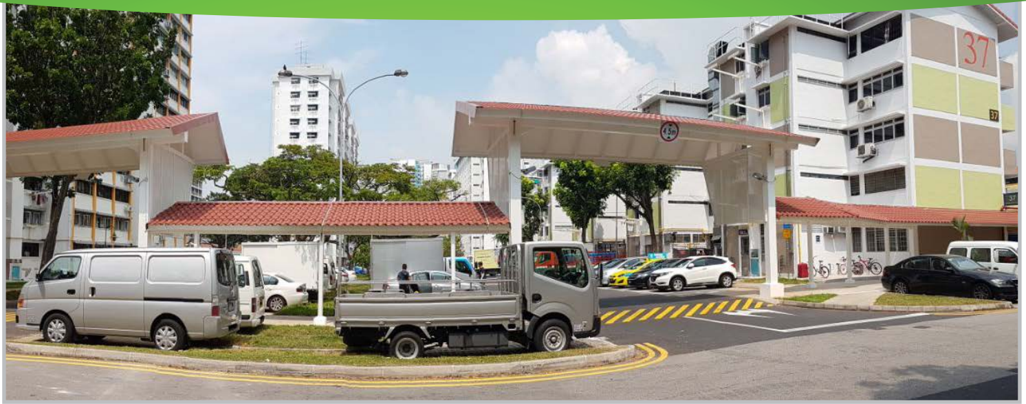
New covered linkway linking Teban Gardens Block 36 and 37 across the carpark